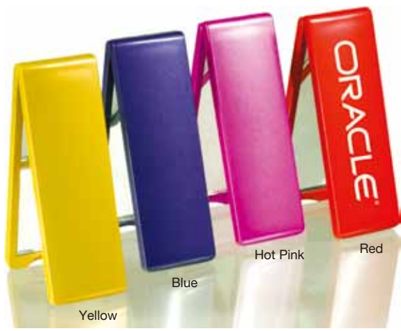
Yellow Blue Hot Pink Red

Packaging: Individual gift box Imprinting: Prices include 1-color 1-location imprint